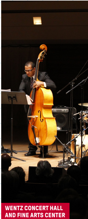
WENTZ CONCERT HALL AND FINE ARTS CENTER