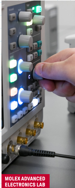
MOLEX ADVANCED ELECTRONICS LAB