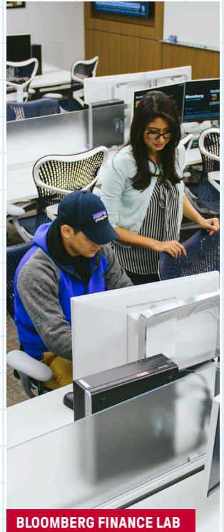
BLOOMBERG FINANCE LAB