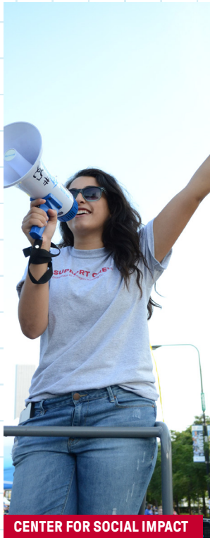
CENTER FOR SOCIAL IMPACT